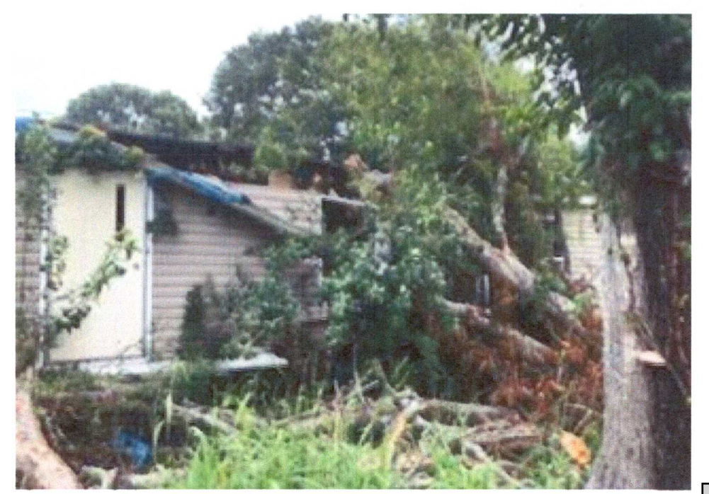
1728 Frank's alley